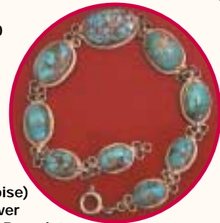
LOT 4: Firoza (Turquoise) and Silver Ladies' Bracelet Estimate: £40