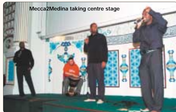
Mecca2Medina taking centre stage