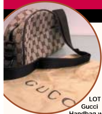
LOT 9: Gucci Handbag with

Gucci packing SIZE : W. 9.5" Estimate: £100