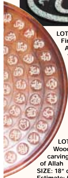
LOT 7: Wooden wall carving, 99 names of Allah SIZE: 18" diameter Estimate: £70