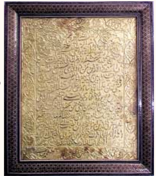
LOT 12: Traditional Persian frame of 'Ayatul Kursi'. Frame consists of Khatam style wood inlay. SIZE: L 25" W 19" Estimate £200