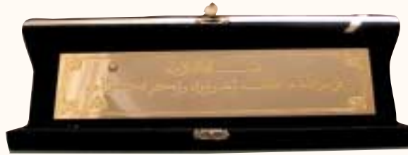
Lot 1: Surah Ikhlas engraved on gold coloured plate in blue velvet presentation box. Estimate: £25

Gucci packing SIZE : W. 9.5" Estimate: £100