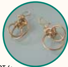
LOT 6: 18ct gold earrings Estimate: £50

May Allah swt reward your generosity with His bounty.