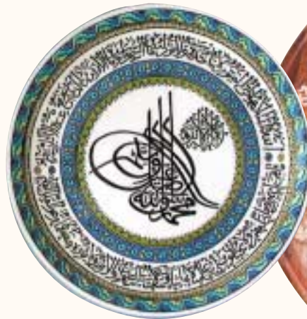
LOT 10: Handpainted plate with Ayatul Kursi Estimate: £120