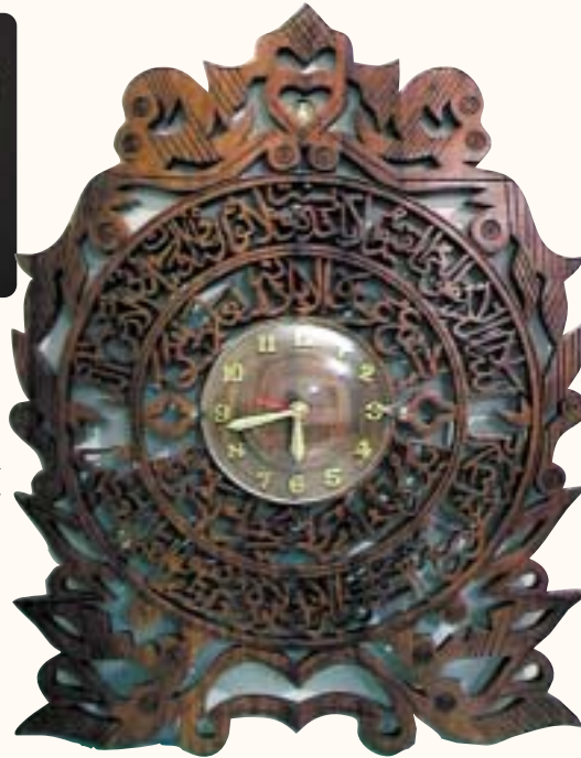
LOT 8: Wooden wall clock with Ayatul Kursi carved in frame. SIZE: L 23" W 17" D 2" Estimate: £80