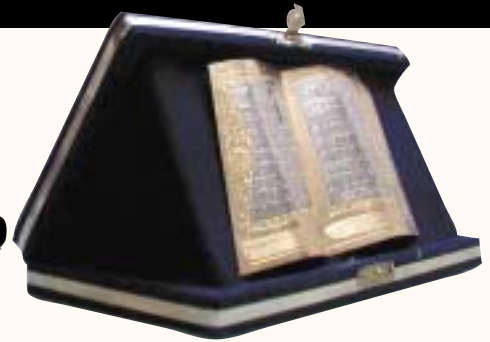
Lot 2: Surah Fateha and Beginning of Surah Baqarah engraved as first two pages of Qur'an on metal plate in blue velvet case. Estimate £25