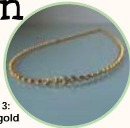
LOT 13: 22ct gold necklace Estimate: £350