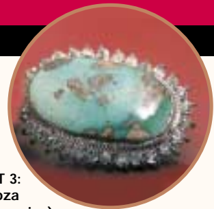
LOT 3: Firoza (Turquoise) Pendant Estimate: £30