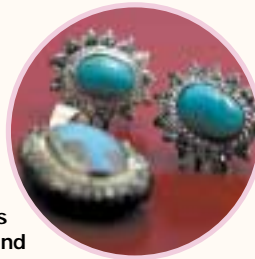
LOT 5: Firoza (Turquoise) Earrings and matching pendant, with silver backing and glass stones' surround Estimate: £40