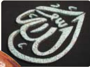
LOT 11: Firoza (Turquoise) Allah, on black velvet back- ground and framed in black Size: W. 12" L. 18" Estimate £150