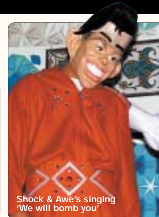
Shock & Awe's singing 'We will bomb you'