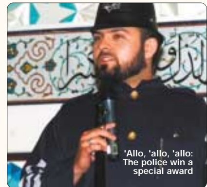
'Allo, 'allo, 'allo: The police win a special award