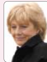
Vanessa Redgarve Actress and Human Rights Campaigner

Warmest greetings to the Islamic Human Rights Commission for the Islamophobia Awards. I'm hoping very much that health will permit me to join you on 17th December.