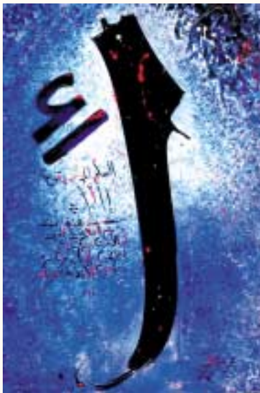
LOT 14: Water based print on canvas by Ali Omar Ermes donated by the artist Alif Kesra (1997) Reserve £500 H 77cm W 51 cm Part of the poem by Muaan Ibn Aws describing the poet's stand for moral purity and honour, rejecting and condemning corruption and social decay.