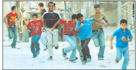
Children in Bakaia refugee camp, Rafah, West Bank being chased by Israeli army, September 2004.

It is the nature of all faiths, the source of all wars, that the weakest are the most vulnerable. The victims of terrorism are the weak, the innocent, the children. The Islamic Human Rights Commission has been working to bring attention to the plight of these children and to demand that the international community stand up to the terrorists. We are not just a religious organization, we are a human rights organization. We believe that every child has the right to a safe and secure future. We believe that every child has the right to be treated with dignity and respect. We believe that every child has the right to be protected from violence and fear.