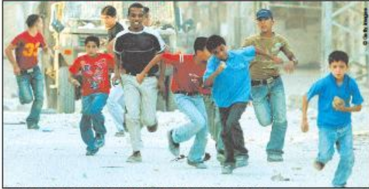
Children in Rafidia refugee camp, Rafidia, West Bank being chased by Israeli army, September 2004.

Read the review of IHRC work 2003 - 2004.