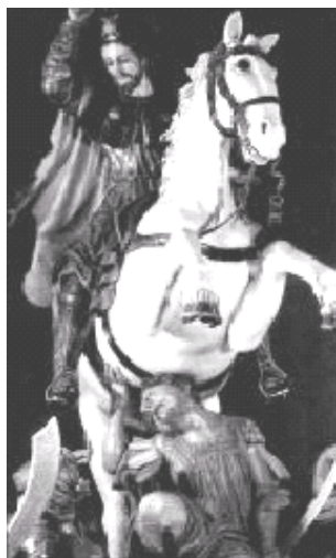
Santiago Matamoros in action