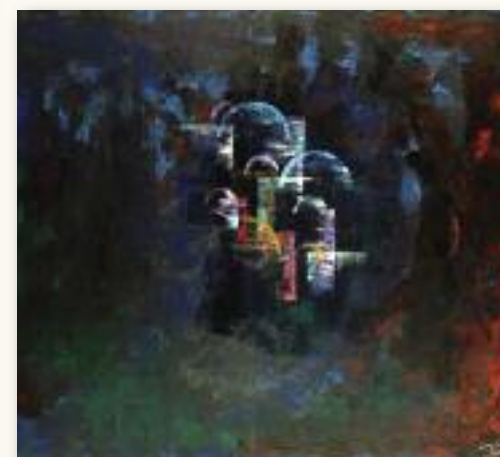
Painting by Siddiq Juma, Night - Acrylic on canvas - 100cm x 100cm. Offers starting at £500