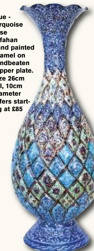
Blue - Turquoise Vase Esfahan Hand painted enamel on handbeaten copper plate. Size 26cm tall, 10cm Diameter Offers starting at £85