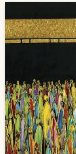
Painting by Siddiq Juma, Pilgrimage - Acrylic on canvas - 80cm x 40cm. Offers starting at £500

Limited edition print signed by Muhammad Ali. This comes with a certificate of authenticity with a picture of the greatest boxer ever signing it. Also comes with unique online authenticity number.