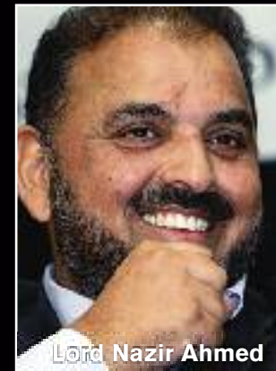
Lord Nazir Ahmed

"I am sorry I cannot attend the Islamophobia Awards 2014, and wait with bated breath to see who this year's worthy - or should that be unworthy? - winners are. It is not often that one expresses one's support for an event by wishing that it should soon go out of business for lack of suitable nominees, but that is, indeed my wish for the event. But whilst there continues to be such a plentiful supply of scurrilous potential nominees, I wish the event every success and I hope you all have an enjoyable evening."