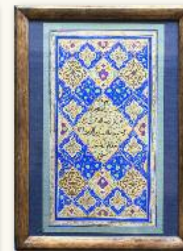
Surah Fatiha Wooden Frame Illumination art by an award winning Iranian miniature artist. Surah fatiha calligraphy. Dimensions 38cm x 28cm x 2cm. Offer starting at £50