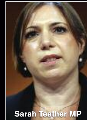
Sarah Teather MP