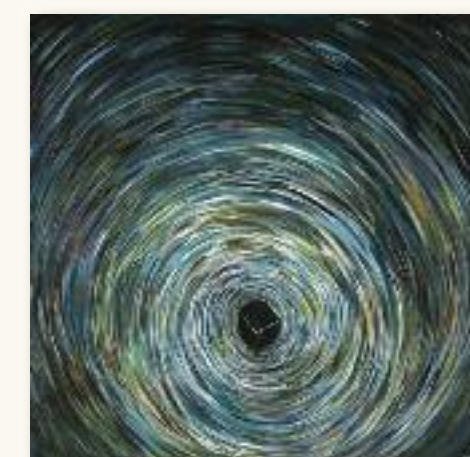
Painting by Siddiq Juma, Journey around the Kaabah - Acrylic on canvas - 100cm x 100cm. Offers starting at £500