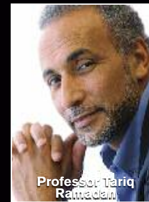
Professor Tariq Ramadan