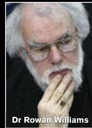
Dr Rowan Williams