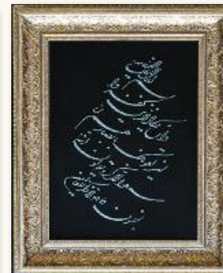
Wa In YaKadhul... - Ayah 68:51 Frame Large. Turquoise stone from Mashhad on a black background, framed in gold. This is a one-off piece, beautifully crafted by hand. Offers starting at £190