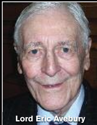
Lord Eric Avebury