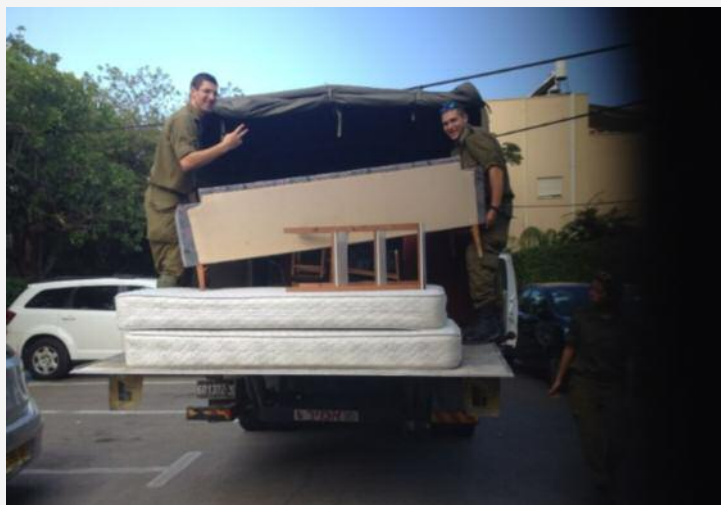
IDF soldiers help deliver furniture to low-income homes with Karmey Chesed.