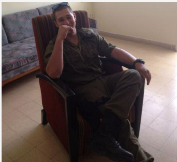
An IDF soldier enjoys his new recliner thanks to Karmey Chesed.

The organization has volunteers going house to house and offering food to those who are in need. "People are simply too scared to leave their houses and go to the supermarket," said one of the volunteers. "There are those who aren't able to go or don't want to risk leaving their homes and the proximity of their safe rooms," he continued.