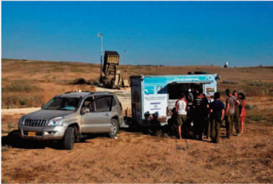
The Standing Together jeep supporting the Iron Dome unit during the recent Gaza war!

Standing Together | A Personal IDF Story That Will Send Shivers Down Your Spine