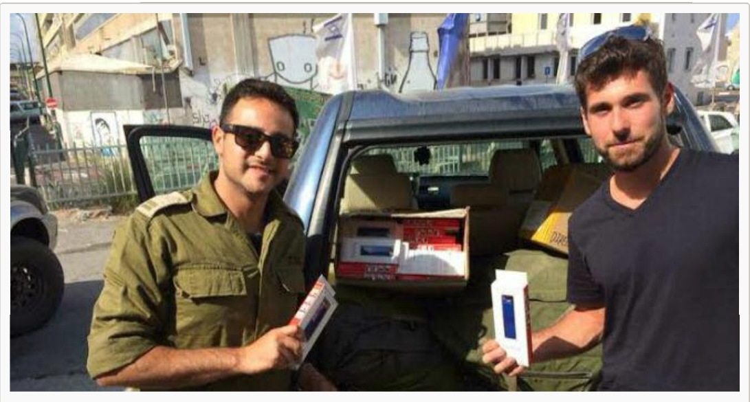
IDF soldiers are now able to call home after returning from the front in Gaza.

For many husbands, fathers, sons and brothers currently serving in Operation Protective Edge, it's been a long few days or even weeks stationed on the front lines or in battle. But for families back home it can feel like a lifetime- with many having gone for extended periods of time without speaking with their loved ones.