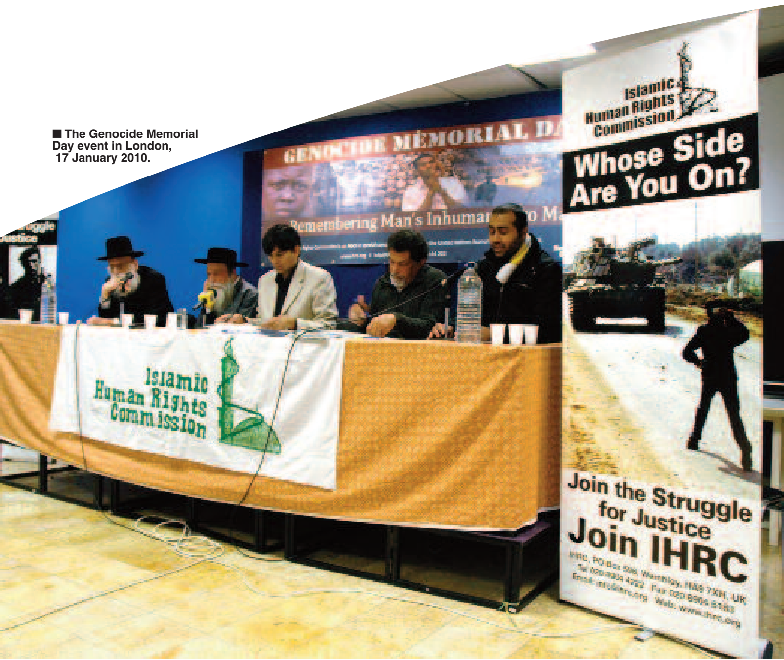
■ The Genocide Memorial Day event in London, 17 January 2010.