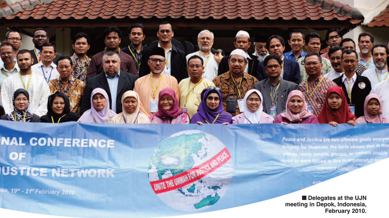
■ Delegates at the UJN meeting in Depok, Indonesia, February 2010.