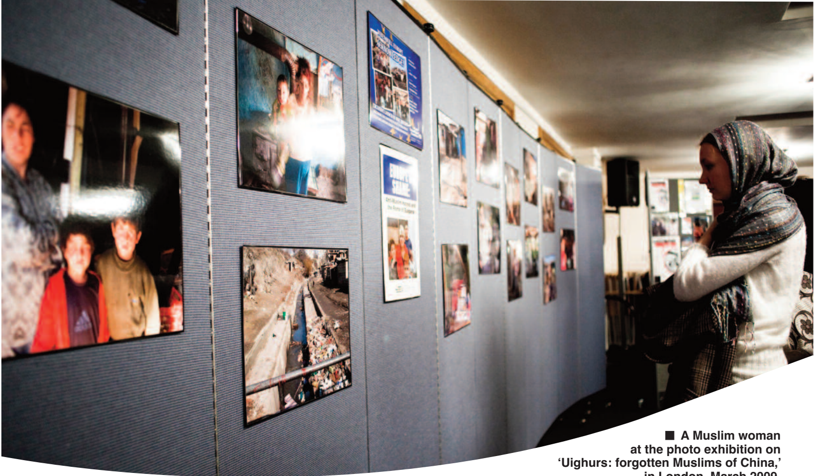
■ A Muslim woman at the photo exhibition on 'Uighurs: forgotten Muslims of China,' in London, March 2009.