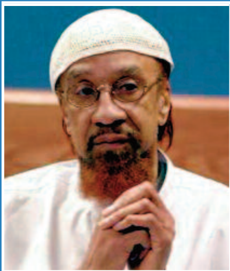
■ Imam Jamil Al-Amin, prisoner of faith in the USA.