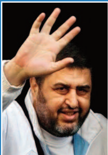
■ Khairat al-Shater, deputy leader of the Muslim Brotherhood in Egypt, has been held without trial since December 2006.