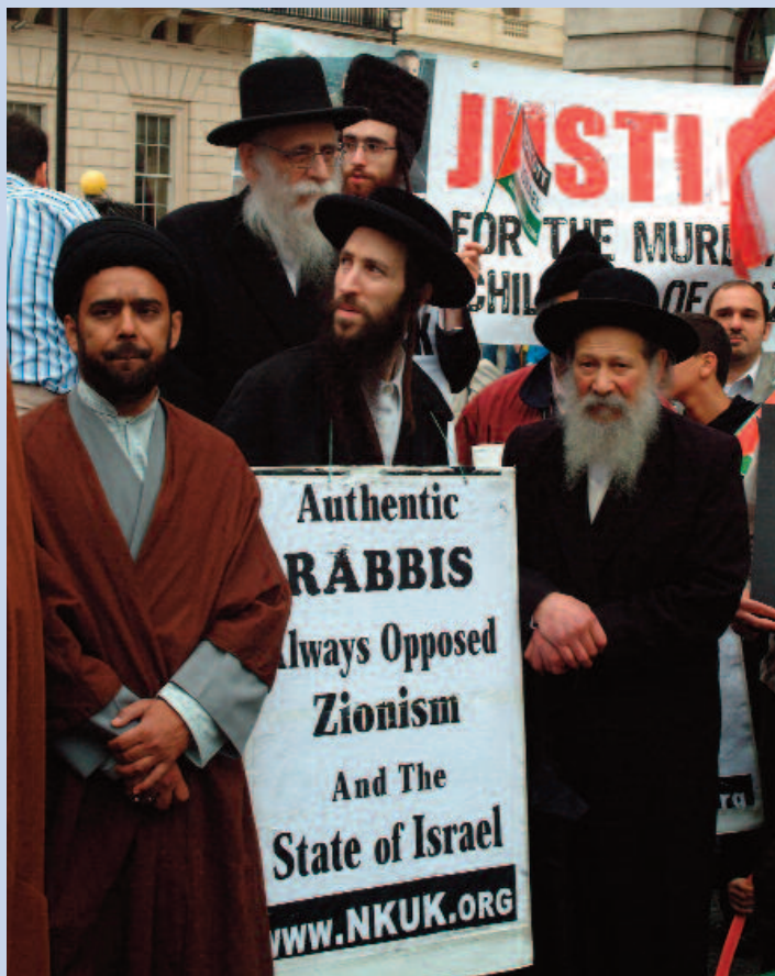
■ Orthodox Jewish Rabbis taking a stand against Israel at the Al-Quds Day March, London, September 2009.