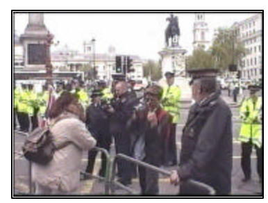
MPS officers filming Muslim demonstrators at the counter-demonstration.

Conversely IHRC observers rarely saw any filming by the police of the Zionist Rally. Also at the Muslim rally on 13<sup>th</sup> April 2002<sup>18</sup> there had been personnel extensively filming and taking pictures in and around the rally, but similar filming of the Zionist Rally in that same manner was simply not taking place. It seems also that on 6<sup>th</sup> May 2002, police cameramen were spending a disproportionate amount of time filming Muslims considering police figures stating that there were 300 Muslim demonstrators