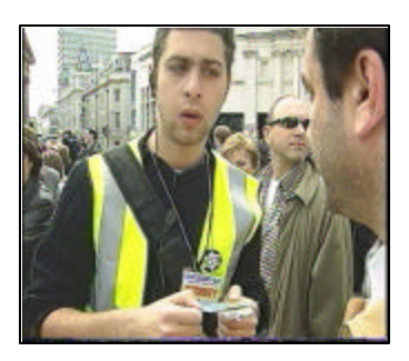
A CST steward checking Press ID in Trafalgar Square.

their attitude and conduct, perceptions of CST have quickly deteriorated. They are now viewed as nothing more than a vigilante group set on scaring off legitimate protest to Israeli atrocities, sanctioned at the same time by the MPS. The relationship between the CST and the Board of Deputies of British Jews is unclear but the head of CST is also director of the Board's security section, and the organisation promotes CST as the security enforcers of the Zionist community's welfare.