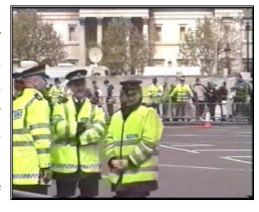
Screening of Trafalgar Square. View from outside Muslim demonstration

physical barrier so that again Muslim protests would be blocked out of view. This suggests a level of complicity between the CST and the MPS in an arrangement where the overall effect of the counter-demonstration became less effective than it could have been. To our knowledge, this is the first time screens were allowed to be erected in Trafalgar Square to block the view and general access of the public and protestors to the Square.