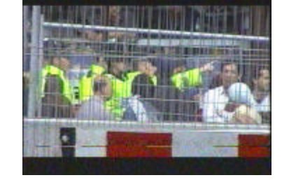
Muslim demonstrators being denied access to Trafalgar Square.

people were refused their right to go into Trafalgar Square on 6^{\rm th} May. At every step the police would question where anyone of Muslim appearance was going. They would either be turned away from joining the Muslim demonstration, or prevented from leaving the Muslim demonstration. This