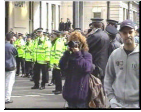
CST accredited photographer taking photographs of Muslim demonstrators from within Muslim demonstration.

only from outside but within the counterincident<sup>24</sup> demonstration. In particular one photographer constantly remained inside the parameters of the demonstration, photographing almost everyone who attended throughout the day. When this was pointed out to police officers by organisers, the officers requested her for ID, upon which she produced a CST issued pass. The police then refused to ask her to leave on the basis that she had been issued a pass by CST.